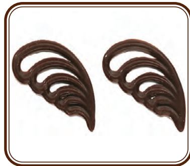
29-E0076 • 500 ct Dark Chocolate Feathers