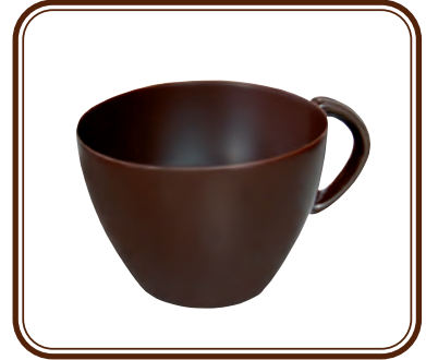
27-TC1-36a • 36 ct Dark Chocolate Tea Cup

1.5" diameter x H 1.3" Holds 14 gr (.5 oz)