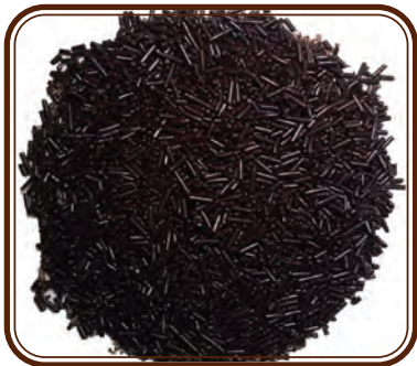
FC-Verm • 5kg (11 lbs) Dark Chocolate Sprinkles (Vermicelli) made with Belgian Chocolate