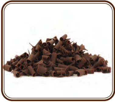
29-E0013 • 26.5 lbs 29-E1020 • 8.8 lbs Dark Chocolate Blossom Curls