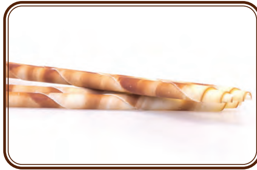
29-E0289 • 130 ct Marble Chocolate Pencil "Van Gough"