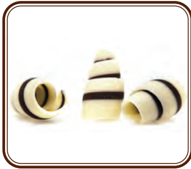
29-E1544 • 200 ct Dark/White Chocolate Swirls