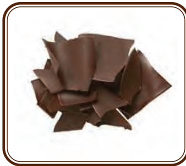
FS-75 • 4 lbs Large Dark Chocolate Ribbon Shavings