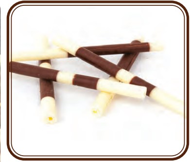
29-E0516 • 130 ct Milk & White Chocolate Pencils "Duo"