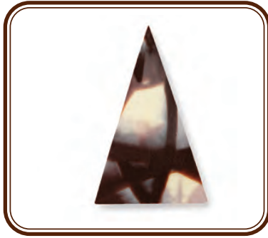
29-E0838 • 490 ct Marble Chocolate Triangle "Jura Point"