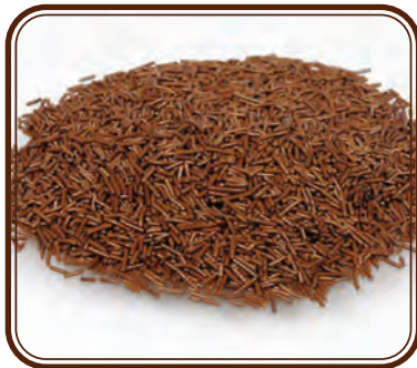
FG-0153 • 10 lbs Dark Chocolate Sprinkles (Decoratifs) made with Guittard Chocolate