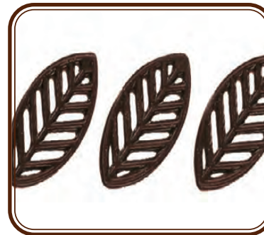
29-E1188 • 550 ct Dark Chocolate Leaves