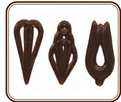
29-E1377 • 610 ct Dark Chocolate "Soiree"