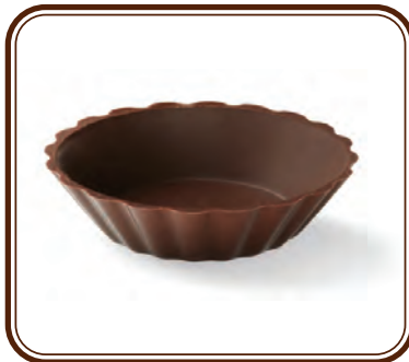
29-E0095 • 390 ct Dark Chocolate Mini Cup

2.75" diameter x H 2.6" Holds 85 gr (3 oz)