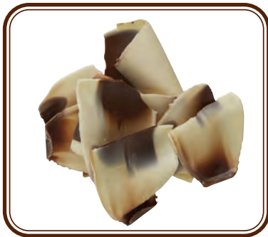
FS-58 • 4 lbs Large Marbled Chocolate Ribbon Shavings