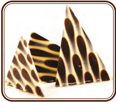
29-E1029 • 490 ct Chocolate Point with Teardrops