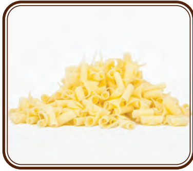
29-E1022 • 8.8 lbs White Chocolate Blossom Curls