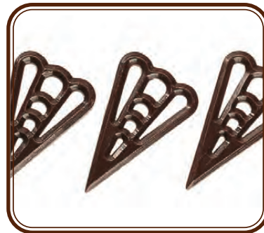
29-E0168 • 475 ct Dark Chocolate Fan