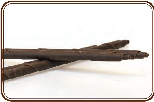
29-E0272 • 130 ct Dark Chocolate Pencils "Ruben"