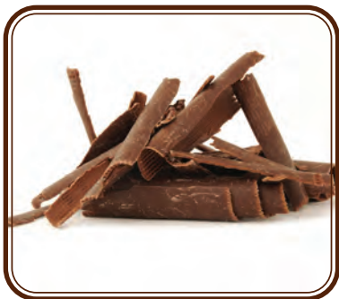
29-E1060 • 5.5 lbs Dark Chocolate Shavings