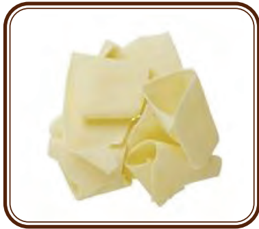
FS-57 • 4 lbs Large White Chocolate Ribbon Shavings