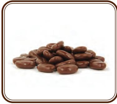
29-E0682 • 1 kg Mocha Chocolate Coffee Beans