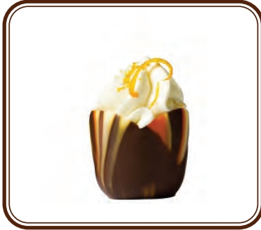
27-PF-2N • 152 ct Pastel Marbled Chocolate Mini Tulip Cup

2.5" diameter x H .9" Holds 50 gr (1.7 oz)