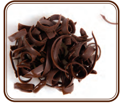
28-D-96333 • 5.5 lbs Dark Chocolate Spaghetti Curls