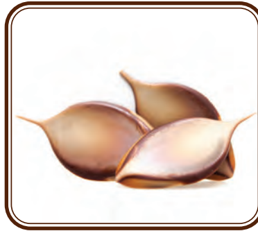
29-E1547 • 333 ct Marble Chocolate Leaves - Special