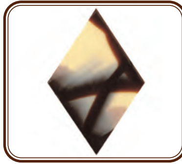
29-E0839 • 360 ct Marble Chocolate Diamond "Jura Rhomb"