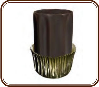
27-ML-QD16 • 154 ct Dark Chocolate Liqueur Cup

1" diameter x H 1.5" Holds 14 gr (.5 oz)