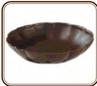
29-E1680 • 42 ct Dark Chocolate Dessert Cup

0.5" diameter x H 1.8" Holds 14 gr (.5 oz)