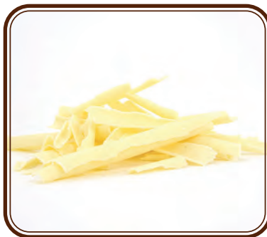
29-E1062 • 5.5 lbs White Chocolate Shavings