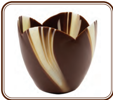
27-TU1-36 • 36 ct Marbled Chocolate Tulip Cup

2.75" diameter x H 2" Holds 76 gr (2.7oz)