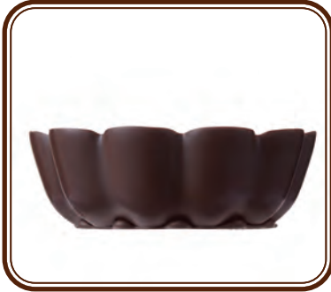
27-ML-Turban • 90 ct Dark Chocolate Turban Cup

1" diameter x H 1.5" Holds 14 gr (.5 oz)