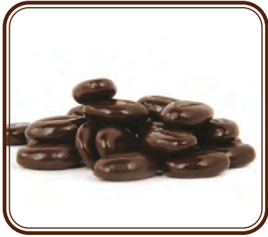
29-E0131 • 8 kg Mocha Chocolate Coffee Beans