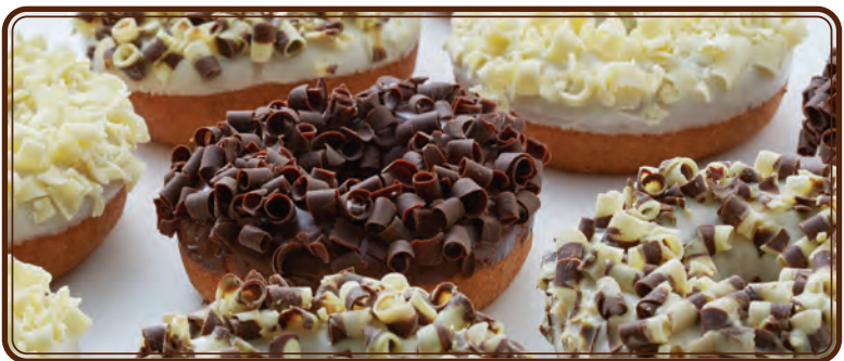
27-DC-35 • 10 lbs Marbled Chocolate Decor Curls