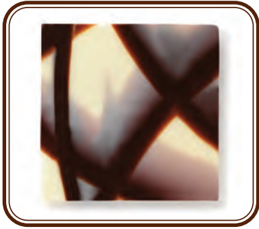
29-E1096 • 360 ct Marble Chocolate Square "Jura Square"