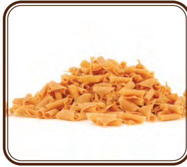
29-E0009 • 8.8 lbs Caramel Blossom Curls